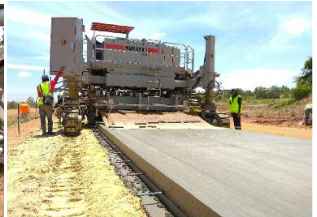
11.5' (3.5 m) Wide Paving Configuration on a 6.7% Super Elevation