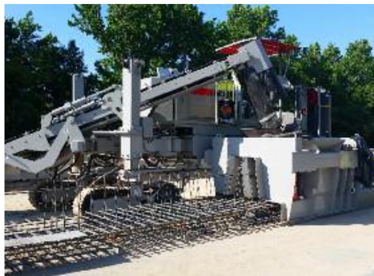
Offset Barrier Wall Base and Other Custom Applications