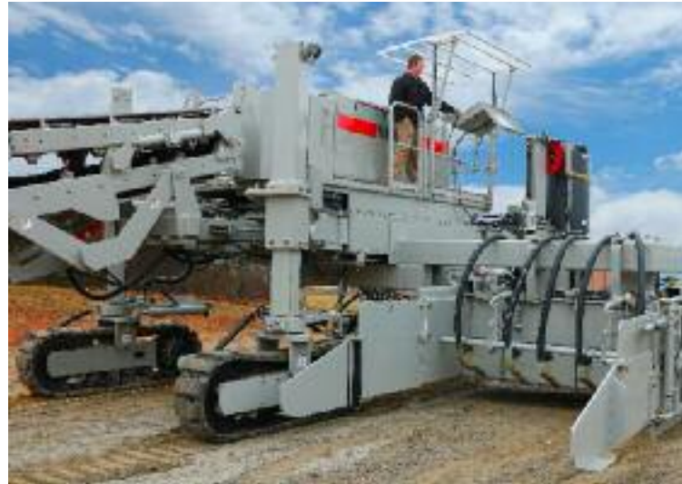
8.2' (2.5 m) Offset Paving Configuration

Secondary sensor on/off controls are located on each leg, allowing the crew to adjust the sensors from the ground, such as for moving the sensors around obstacles while pouring.