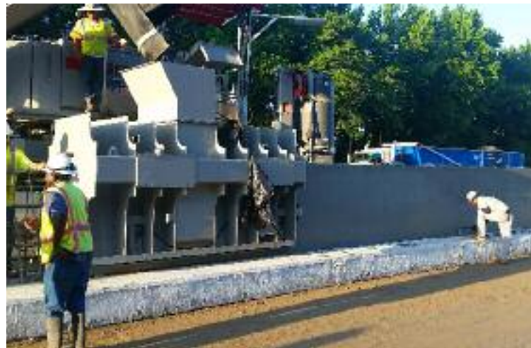
Offset Barrier Wall