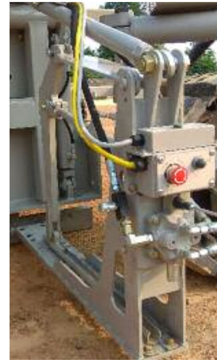
Optional Tie Bar Inserter.