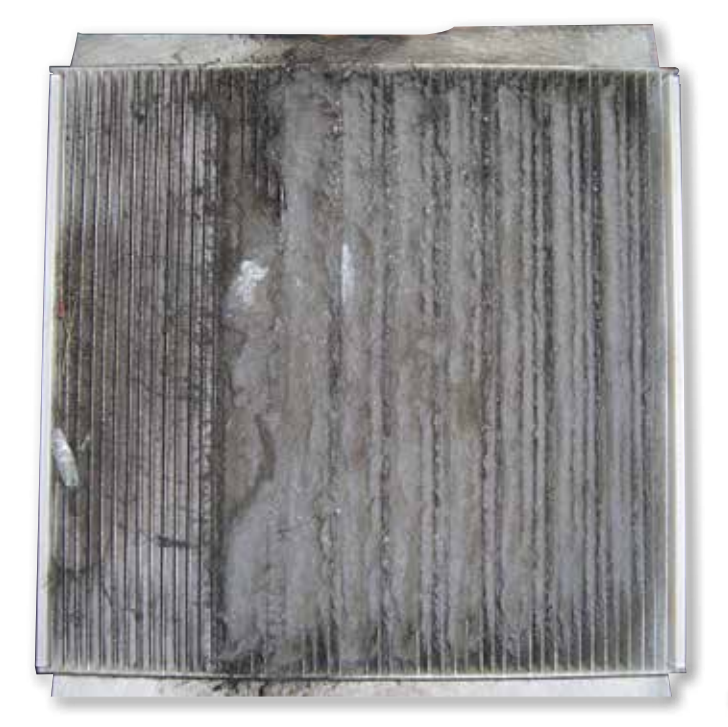
Old Cabin Air Filter at 120,000 miles

No matter who manufactures a cabin air filter, every filter eventually needs to be changed, said Bilski, It is important to change a filter every 12,000 to 15,000 miles, or according to the original manufacturer's recommendations. The good thing is that replacing a heavy-duty cabin air filter is a job that does not require hours—but only a matter of minutes. "Most cabin air filters can be changed in 15 minutes or less," Bilski said.