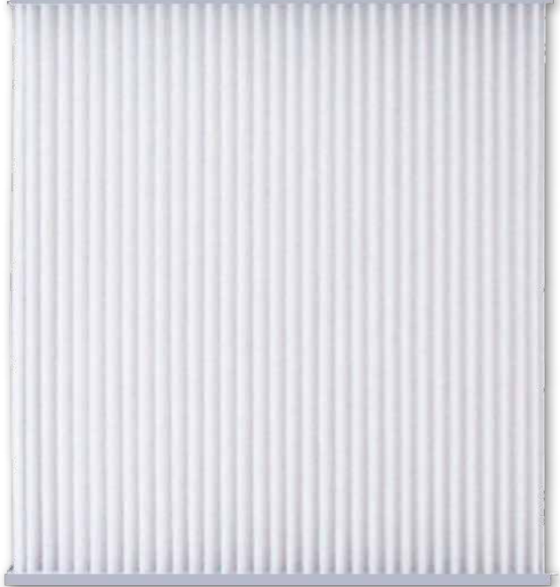
New Cabin Air Filter takes less than 15 minutes to install and has a 12,000 to 15,000-mile recommended change interval.